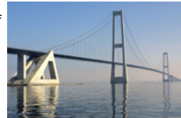
Great Belt Bridge in Denmark

Last week, Thursday, May 20th, was the celebration of "World Metrology Day" in recognition of the importance of measurement and calibration sciences. The celebration web site